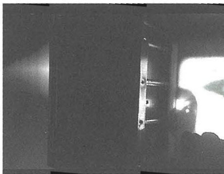
(Just Beyond the screen) the universe—as we know it—is ending

An abridgement of Melanie Klein's seminal Narrative of a Child Analysis with colour plates. The original ninety-three sessions winnowed to sixteen. Music by Benjamin Britten.